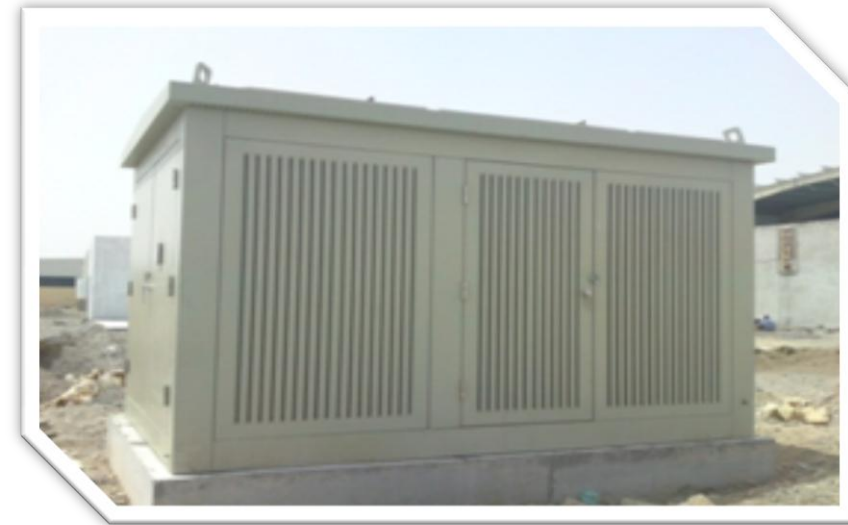
↑ Package distribution substation in Ibri